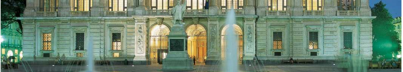
Turin - Palazzo Madama

Arrival at Turin Airport and transfer to the hotel. Meeting with the Cube staff in the hall of the hotel to have a short briefing. Lunch in an historical café downtown. After lunch, with a private guide, start on the visit by foot of Roman Quadrilateral district then the historical shops (chocolate shops, antique dealers, pastry shops, wine bars), trendy shops and typical gastronomic piedmont excellences. Tasting the famous hot chocolate cream and return to the hotel. Dinner in a well-known Michelin starred restaurant. Overnight.