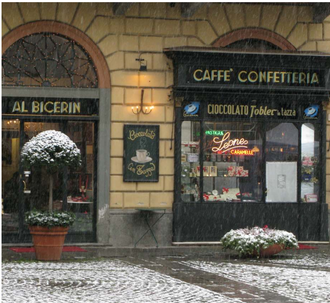
Turin - Historical chocolate shop

The roads of tastes and colours: wine, truffles, cheese, olive oil