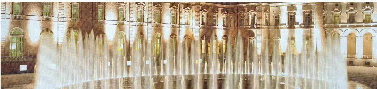
Turin - Reggia di Venaria

Breakfast in the hotel, meeting with the Cube staff in the hall. Transfer by private car or minivan to Eataly, the most original food and wine market of local gastronomic delights where it is possible to appreciate the high quality's food. Lunch in a starred Michelin restaurant inside Eataly. Transfer to the Cinema's Museum in the Mole Antonelliana building, with ascent to the top of the Mole. Short walk the historical central streets in town centre. Transfer by private car or minivan to La Venaria Reale Royal Palace. Visit the magnificent Savoy Residence and its gardens. Aperitif and dinner in a Michelin starred restaurant located in the Residence. Overnight.