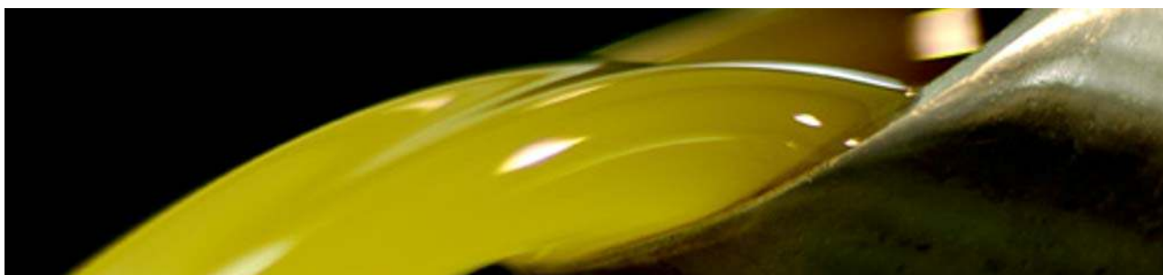
Liguria- the famous olive oil

Breakfast in the hotel and departure by private car or minivan to Liguria driving through the "Colle di Nava". The impressive landscape shows the characteristic villages and the guests can have some stops in Borghetto d'Arroscia, Dolcedo and Badalucco to discover and tasting the delicious olive oil of this Region. Lunch in an excellent restaurant. During the tour the guests will gormandize the typical ligurian "focaccia" and "pasta al pesto". The tour will stop in Ventimiglia just in time for a visit of the historical center. Dinner prepared with fish specialties.