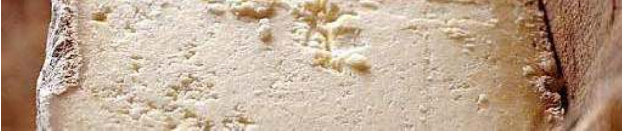
Piedmonts' cheese - the Castelmagno

Breakfast in the hotel and departure by private car or minivan to Isolabona for another delightful olive oil tasting in a famous factory. Visit the scenic villages of Dolceacqua e Apricale. Lunch in a typical restaurant. Departure to Turin passing through the "Colle di Tenda". Arrival in hotel, free time and rest. Dinner in a exquisite restaurant in the city and overnight in the hotel.