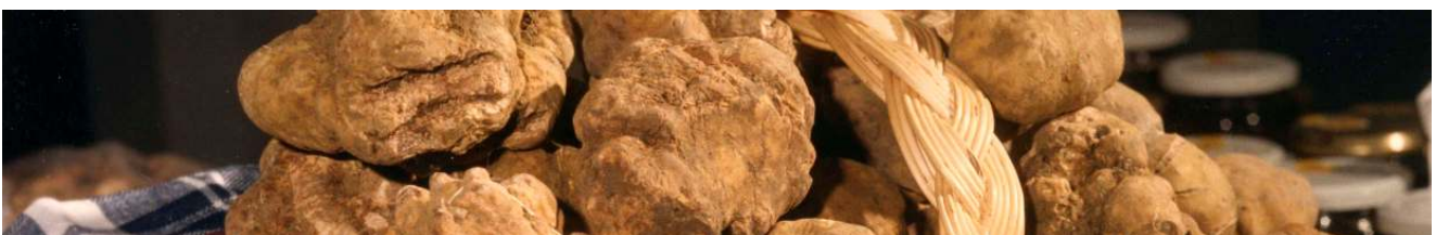
The Langhe - Truffles