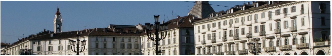
Turin – Piazza Vittorio

Transfer with private car or minivan from the airport to the Hotel downtown in Turin, meeting in the hall of the hotel with our staff for a short briefing. Cooking chocolate school, then shopping. Dinner in a starred Michelin restaurant in the center of the city.