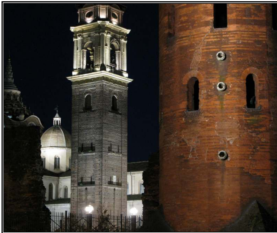
Turin- Porta Palatina