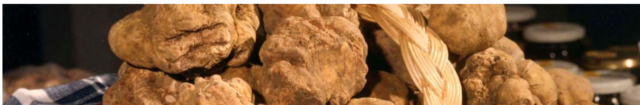
The Langhe – Truffles

Breakfast in the hotel and departure to The Langhe with the Cube staff. Arrive in Alba, wine-tasting of Barolo wine in one of the most famous vineyards producer, lunch with gastronomic delights in a famous restaurant in Alba. Prosecution, with a local private guide, of the visit to Grinzane, La Morra, Serralunga, Monforte, Barolo where it is possible to visit the wine cellar of the Castle and the Barolo Museum WIMU. At the end of the day, the guests will reach Pollenzo for the dinner and the night in the hotel.