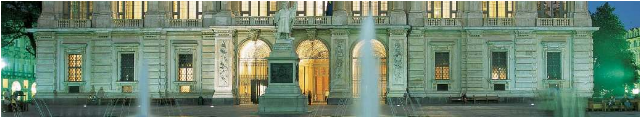
Turin - Palazzo Madama

Meeting with the Cube staff in the hall of the hotel for a little briefing. Lunch in an historical café of Turin. After lunch, by foot and with a private guide, beginning of the promenade in the center to appreciate streets, squares and monuments of the city: Saint Lorenzo's Church, the Cathedral, Roman Relics (ruins of the Theatre and Porta Palatina, Palazzo di Città Square, Palazzo di Città Street, Corpus Domini's Church, Garibaldi Street, Roma Road, San Carlo Square, Maria Vittoria Street, Accademia delle Scienze Street, Carignano Palace, Carlo Alberto Square. Return to the hotel and dinner in a well-known Michelin star restaurant. Night in hotel.