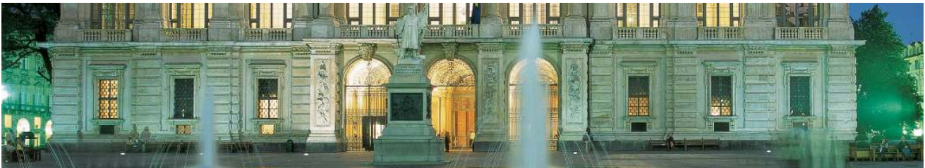
Turin - Palazzo Madama

Breakfast in the hotel. Departure of the guests in the morning by private coach from the hotel to Turin, accommodation in the booked hotel. Meeting with the local guide in the hall of the hotel and starting of the visit. Lunch in an historical café. After lunch, by foot, beginning of the promenade in the center to appreciate streets, squares and monuments of the city: Saint Lorenzo's Church, the Cathedral, Roman Relics (ruins of the Theatre and Porta Palatina, Palazzo di Città Square, Palazzo di Città Street, Corpus Domini's Church, Garibaldi Street, Roma Road, San Carlo Square, Maria Vittoria Street, Accademia delle Scienze Street, Carignano Palace, Carlo Alberto Square. Return to the hotel and dinner in a well-known Michelin starry restaurant.