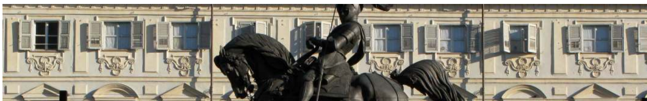
Turin - Piazza San Carlo

Breakfast in the hotel, meeting with the clients in the hall, transfer to start the visit to Cinema's Museum in the Mole Antonelliana building with ascent to the top of the Mole. Light lunch in historical café in the town-centre. In the afternoon beginning of roman quadrilateral district tour and visit the historical shops (chocolate shops, antique dealers, pastry shops, wine bars), trendy shops and typical gastronomic piedmont excellences. Tasting of the famous hot chocolate cream and return to the hotel. Dinner in a good restaurant downtown.