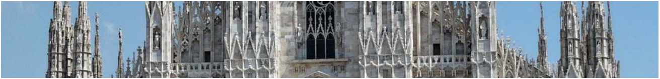
Milan - Duomo

Breakfast in the hotel and full day's tour first by foot and then by bus. Visit of the Alla Scala Theatre and his Museum, Vittorio Emanuele's Gallery and Duomo interiors and terraces, the Basilica of Sant'Ambrogio, San Lorenzo and Sant'Eustorgio's Cathedral with Portinari Chapel, Castello Square. City sightseeing. Visit of the Brera's Picture-Gallery. Return to the hotel and dinner in a famous restaurant in the center of the city.