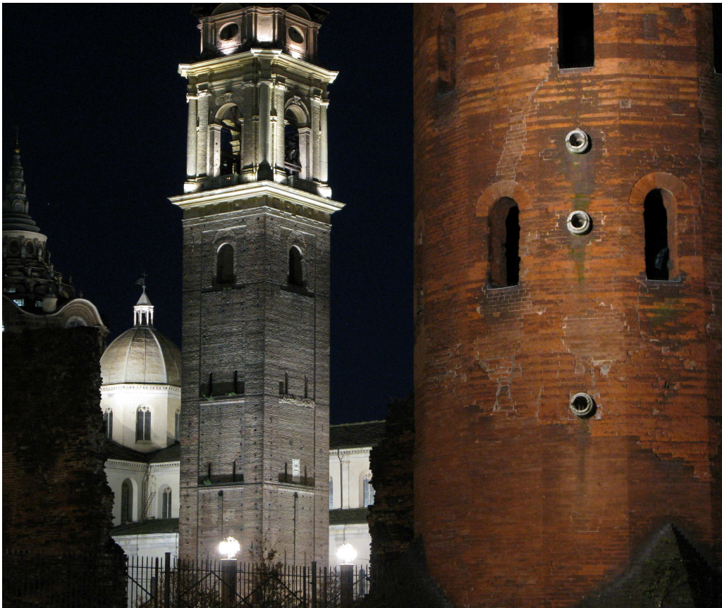
Turin – Porta Palatina