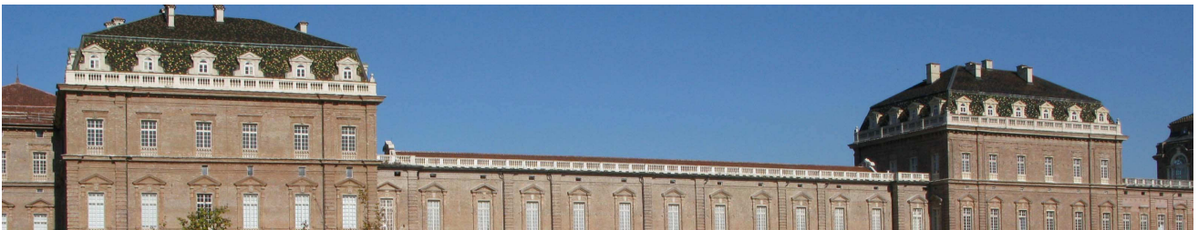
Turin - Reggia di Venaria

Breakfast in the hotel, meeting with the Cube staff in the hall. Transfer by private car or minivan to Eataly, the most original food and wine market of local gastronomic delights where it is possible to appreciate the high quality's food. Lunch in a starred Michelin restaurant inside Eataly. Transfer to the Cinema's Museum in the Mole Antonelliana building, with ascent to the top of the Mole. Short walk the historical central streets in town centre. Transfer by private car or minivan to La Venaria Reale Royal Palace. Visit the magnificent Savoy Residence and its gardens. Aperitif and dinner in a Michelin starred restaurant located in the Residence. Overnight.