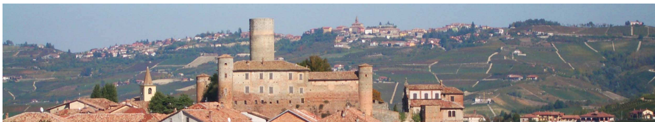
The Langhe - Grinzane

Breakfast in the hotel and visit the Banca del Vino (Wine Bank). Departure by private car or minivan to Barbaresco land, with a local private guide, through Benevello, Treiso, Mango, Barbaresco, Neive. In here should be interesting to have a wine-tasting of Barbaresco. Lunch in a typical restaurant with gastronomic regional specialities. In the afternoon transfer to Murazzano tasting this famous cheese. Transfer to Govone's Castle to enjoy dinner in a Michelin starred restaurant in a Savoy Residence. Overnight in Govone.