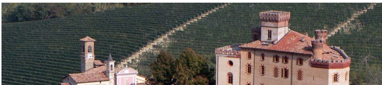
The Langhe - Castello di Barolo

Breakfast in the hotel, meeting with the guide in the hall, departure to visit the main castles and fortresses of The Langhe by private car or minivan. The tour suggest to begin visiting the Royal Castle of Racconigi with its park, the Summer Lodge of the Royal Savoy Family, the Manta's Castle at Saluzzo, a well preserved medieval manor-house of the thirteenth century, the Barolo's Castle of the tenth century, surrounded in a see of