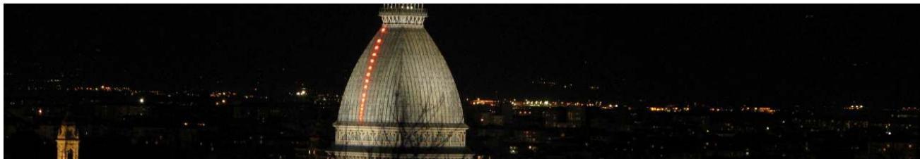
Turin - Mole Antonelliana

Breakfast in the hotel, meeting with the clients in the hall, transfer to start the visit to Cinema's Museum in the Mole Antonelliana building with ascent to the top of the Mole. Light lunch in historical café in the town-centre. In the afternoon beginning of roman quadrilateral district tour and visit the historical shops (chocolate shops, antique dealers, pastry shops, wine bars), trendy shops and typical gastronomic piedmont excellences. Tasting of the famous hot chocolate cream and return to the hotel. Dinner in a good restaurant downtown.