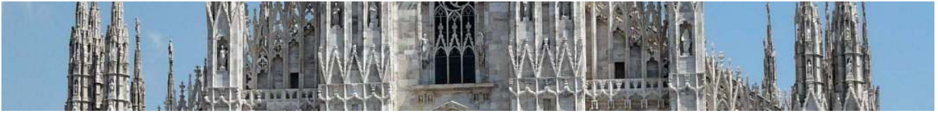
Milan - Duomo

Transfer by private car or minivan from the airport to the Hotel downtown. Meeting in the hall of the hotel with our staff for a short briefing and start on tour by foot. Visit of the Alla Scala Theatre and his Museum, Vittorio Emanuele's Gallery and Duomo interiors and terraces, the Basilica of Sant'Ambrogio, San Lorenzo and Sant'Eustorgio's Cathedral with Portinari Chapel, Castello Square. City sightseeing. Return to the hotel and dinner in a famous restaurant in the center of the city.