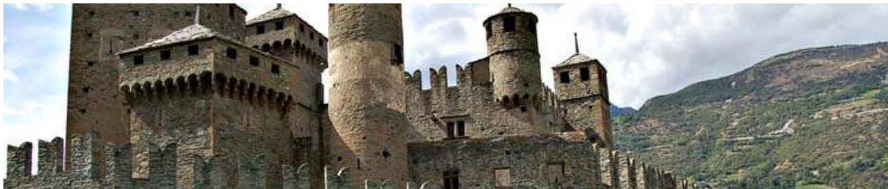
Aosta Valley - Castello di Fenis

Breakfast in the hotel, meeting with the guide in the hall, departure to visit the most well known castles of the Aosta Valley by private car or minivan. The tour suggest to begin visiting the Agliè Duca's Castle, manor-house of the Royal Savoy Family, work of the Castellamonte, the Fortress of Bard, imposing defensive work of barrage of the 800's. Lunch in a restaurant in the valley to savour the local tastefully recipes. Prosecution of the visit to the Fénis' Castle (escorted by a local guide), one of the most famous manor-house of the Middle Age dated back to the 1300. At the end of the day, the guests will return to Turin to have dinner and overnight.