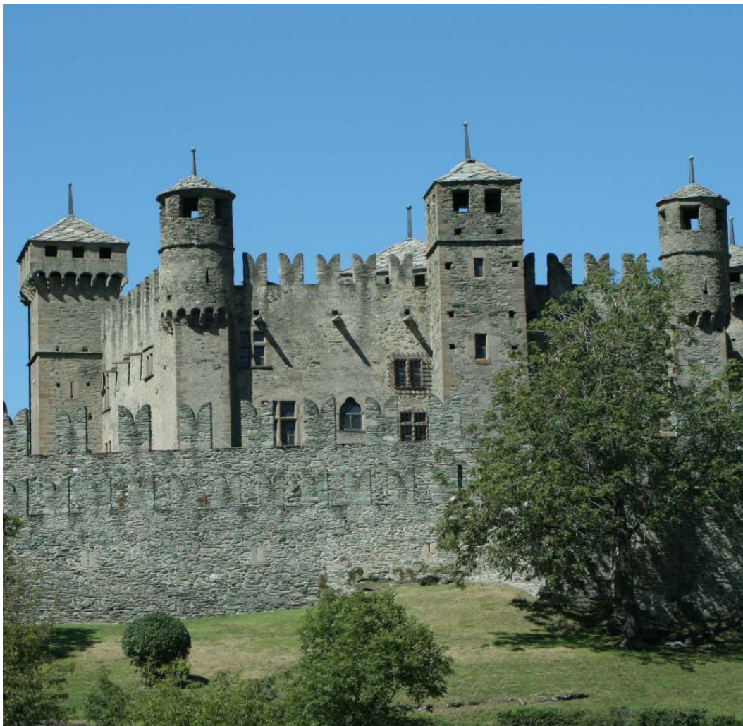
Aosta Valley– Fenis Castle