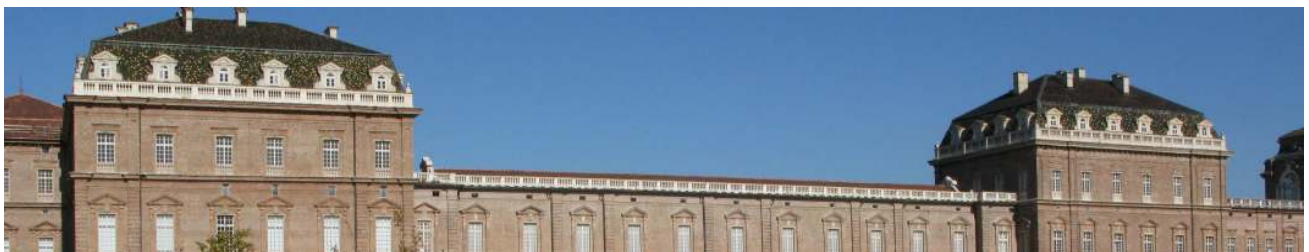
Turin - Reggia di Venaria

Breakfast in the hotel, meeting with the local guide in the hall to visit Palazzo Madama with the archeological site and the Juvarra's main stair, Royal Palace, Royal Square and Egyptian Museum. Light lunch in an historical café-restaurant downtown. Short walking in the historical central streets and transfer to Venaria Royal Palace by private car or minibus. Visit the Savoy Residence and its gardens. Aperitif and dinner in a Michelin starry restaurant located in the Residence.