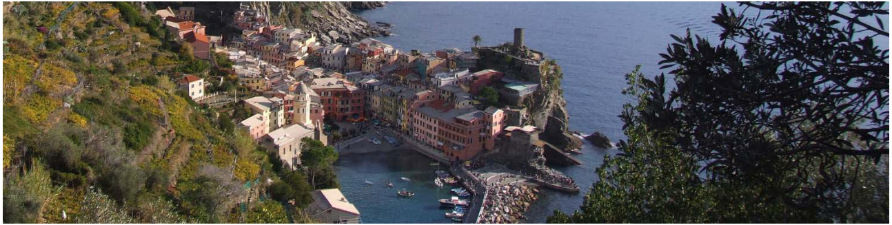
Vernazza – Cinque Terre

Breakfast in the hotel. Departure to the Cinque Terre. Tour of the famous five villages along the sea by a private boat, on the way tasting the well-known pesto at Manarola or Riomaggiore in a typical restaurant. At the end of the tour transfer to Milano, arrival to the hotel in the evening, accommodation. Dinner in a recommended restaurant in the centre of Milano. Overnight.