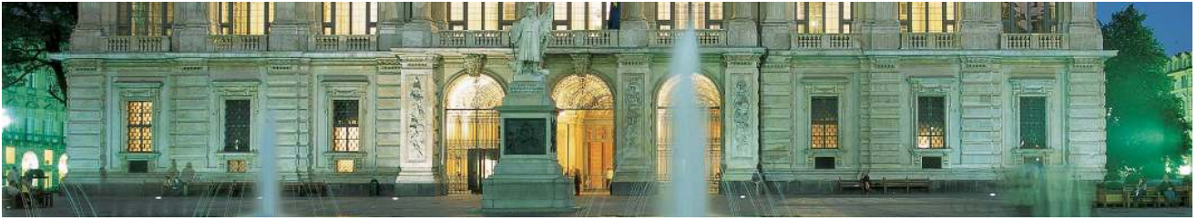
Torino - Palazzo Madama

Transfer by a private coach or minivan from Milano Malpensa's Airport to Turin. Accommodation in the hotel. Meeting with a private guide in the lobby and beginning of the tour. Lunch in an historical palace downtown. After lunch, by foot, beginning of the promenade in the centre to appreciate streets, squares and monuments of the city: Saint Lorenzo's Church, the Cathedral, Roman Relics (ruins of the Theatre and Porta Palatina), Piazza Palazzo di Città, Via Palazzo di Città, Corpus Domini's Church, Via Garibaldi, Via Roma, Piazza San Carlo, Via Maria Vittoria, Via Accademia delle Scienze, Palazzo Carignano, Piazza Carlo Alberto. Back to the hotel and dinner in a starred Michelin's restaurant downtown, overnight.