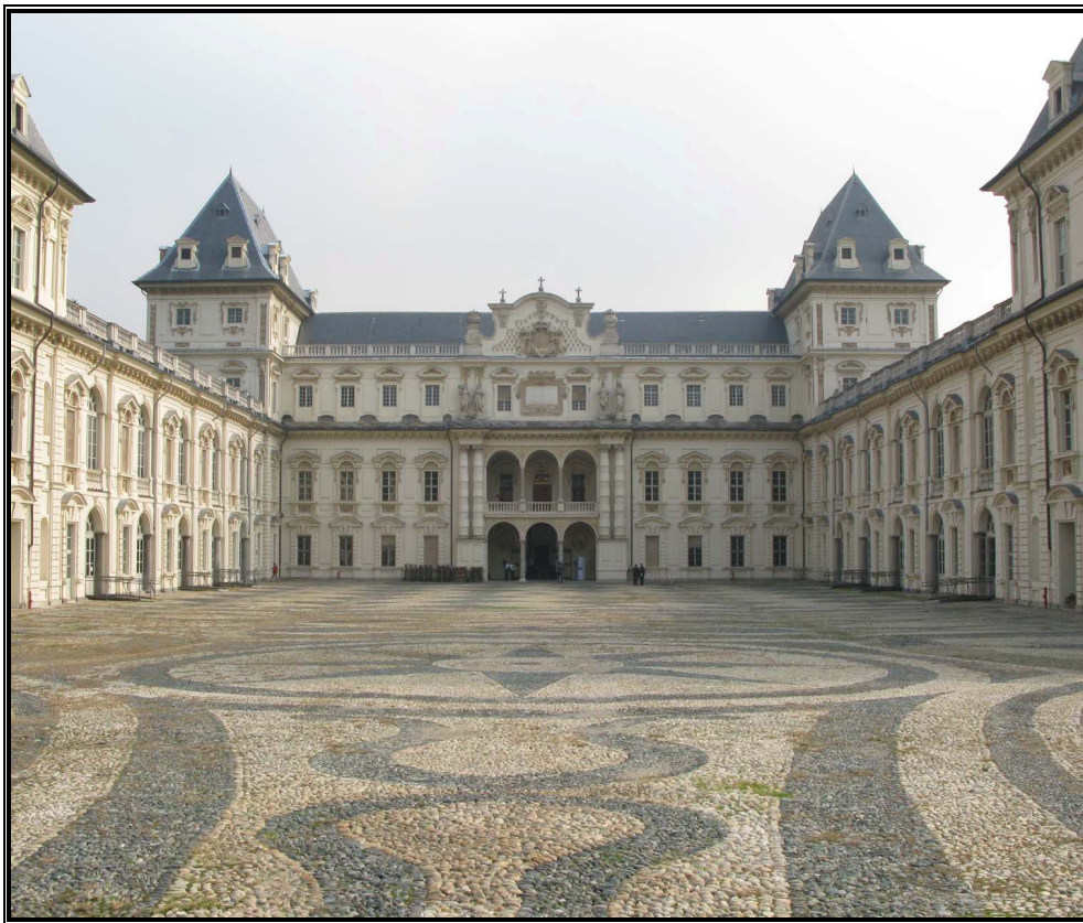
Turin – Castello del Valentino